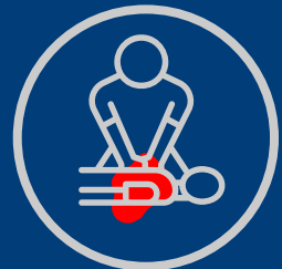
Wearable Trainers for Scenario

A Commitment to Quality, Affordability, and Realism