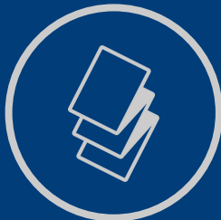
Simulated Hemostatic Gauze