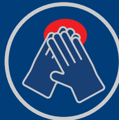
Tabletop Trainers for Classrooms