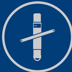
Tourniquet Application Trainers