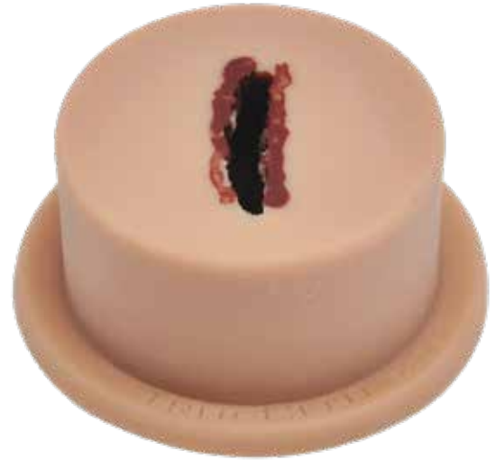
Item # 5167