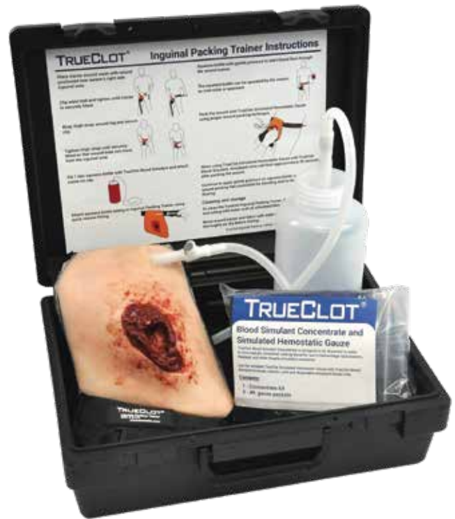
Item # 5174

*NOTE: Add "L" for Light Skin and "D" for Dark Skin tone.