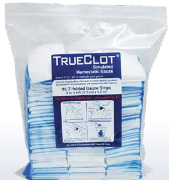
Item # 5125