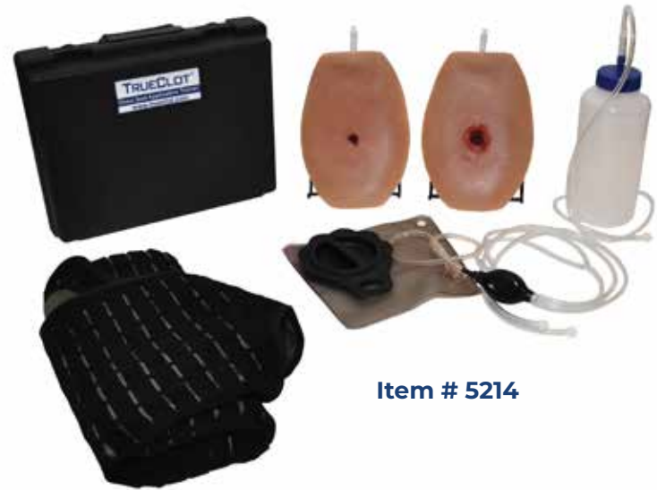
Item # 5214

*NOTE: Add "L" for Light Skin and "D" for Dark Skin tone.