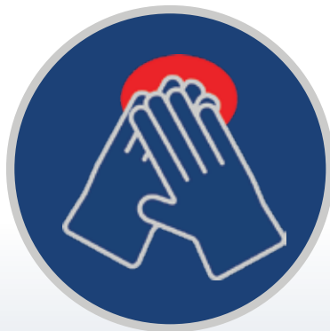
Tabletop Trainers for Classrooms