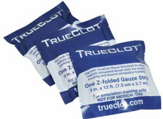
Item # 5123