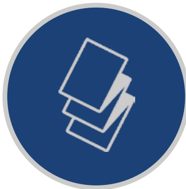
Simulated Hemostatic Gauze