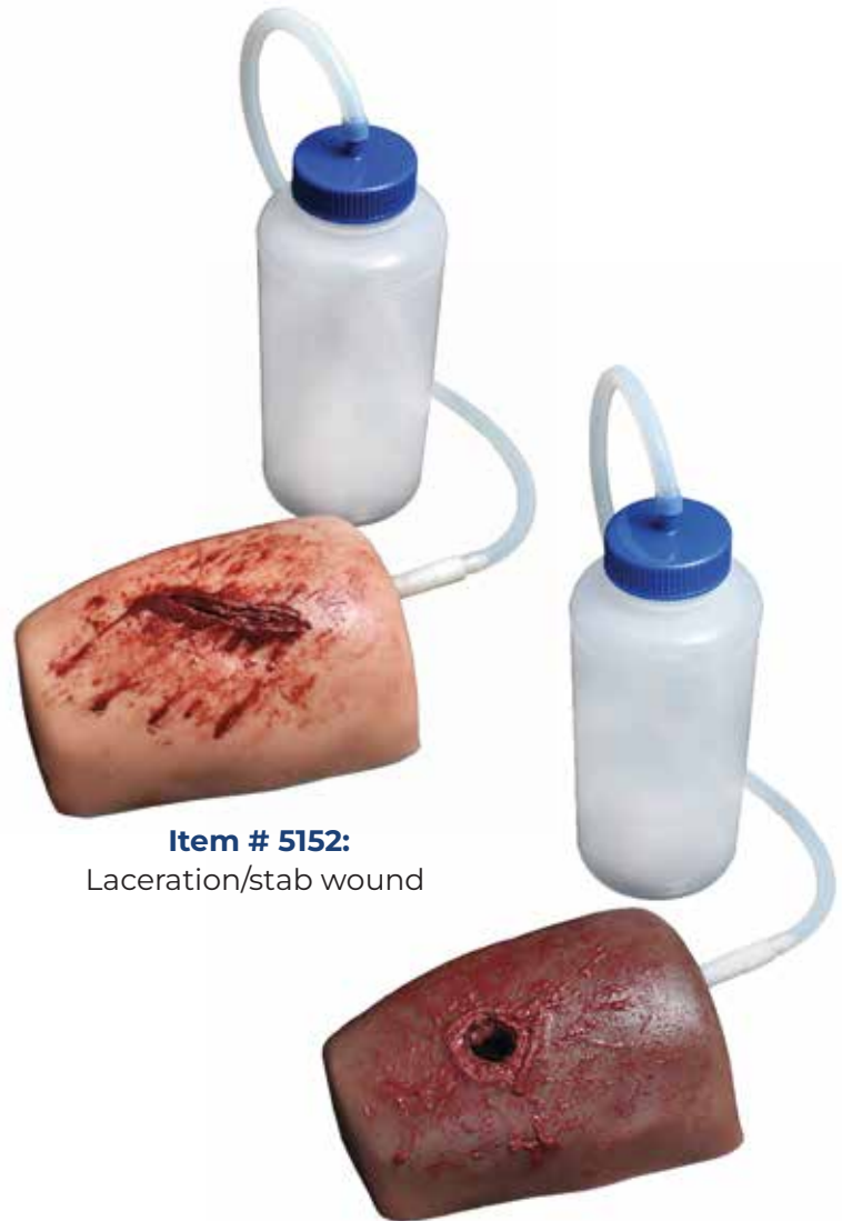
Item # 5152: Laceration/stab wound