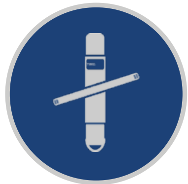
Tourniquet Application Trainers