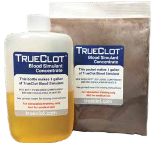
Item # 5115: 1 Gallon (3.8 L) packet