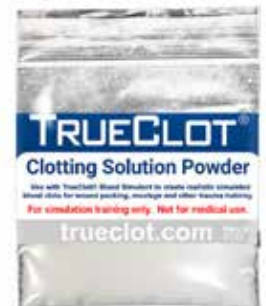
Item # 5133: Powder (Available outside of N. America only)