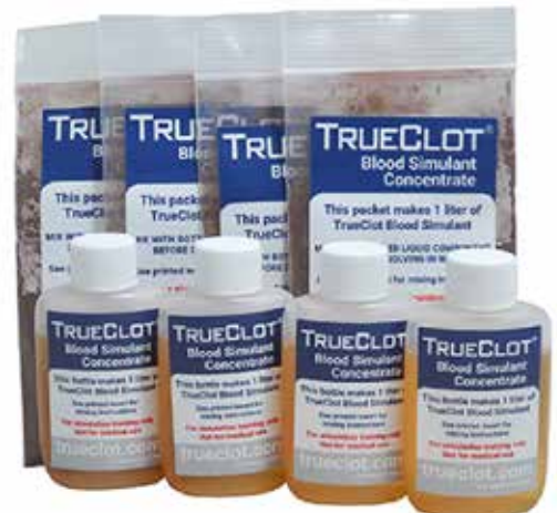
Item # 5117: 4 x 1 L packets