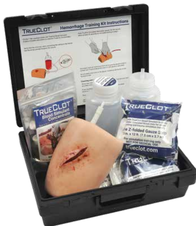
Item # 5155: LAC w/ Z-folded gauze

*NOTE: Add "L" for Light Skin and "D" for Dark Skin tone.