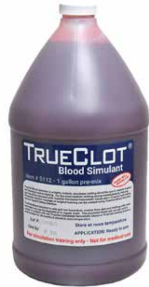
Item # 5112: 1 Gallon (3.8 L)