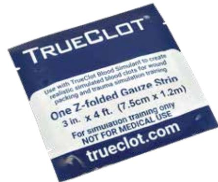
Item # 5124