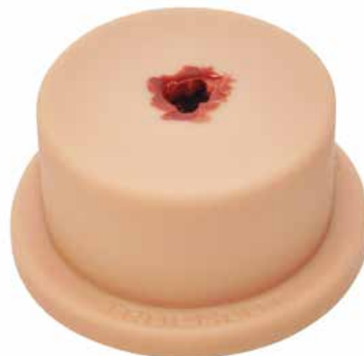
Item # 5164