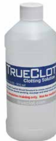
Item # 5132: Solution